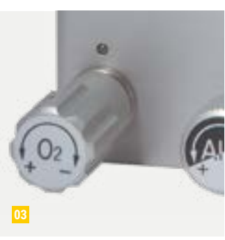
01 GAS SELECTOR DETAIL02 O<sub>2</sub>+ FLUSH BUTTON DETAIL03 KNOB DETAIL